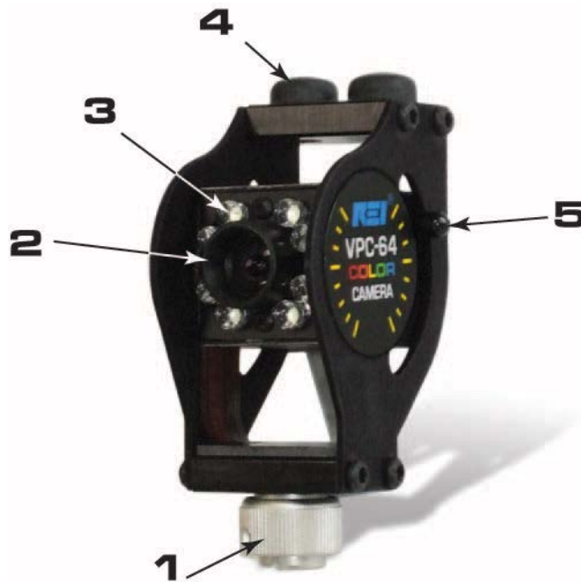
Figure 2 “Camera Head” (Color Camera Head Pictured)